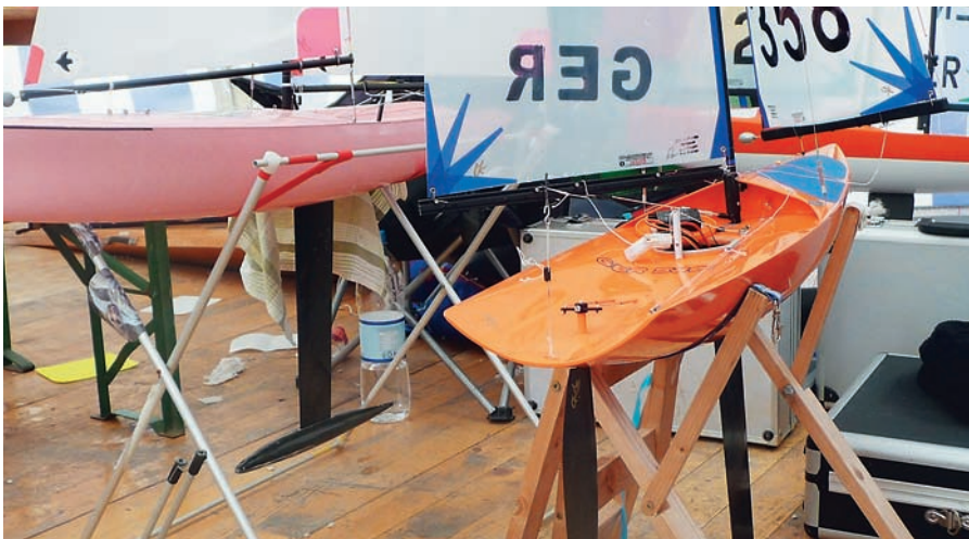
The generally light-air 2008 Europeans in Croatia were dominated by less extreme designs. Foreground left to right, Karaoke, modified Topiko and Disco designs. Second row: Extreme, Taktic and Topiko. Left: the heavily flared German Test-5s fared less well at 56th and 61st overall

designs were a lowered mast position and a raised or heavily cambered foredeck which permit each rig to be carried further up-range, thanks to the lower heeling arm and the ability to shed water when the bow is depressed on a run.