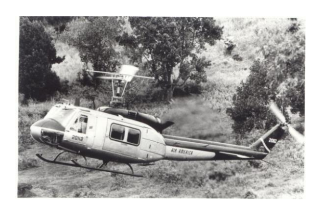
Bell UH-1H 20112 somewhere in South Vietnam in 1973