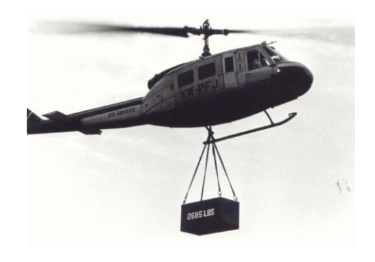
Two photos of Bell 205 XW-PFJ, both taken at Udorn in 1973

Bell UH-1D (205D) XW-PFJ 3211 21 Sept. 67 bought new