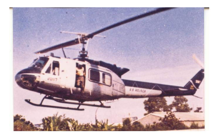
Bell UH-1H 20117 somewhere in South Vietnam in 1973 ( Air America Log , vol. VII, no. 9, 1973, p. 6)