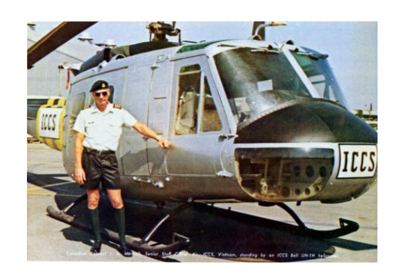
ICCS Air Services UH-1H (Air America Log, vol. VII, no. 8, 1973, p. 1)

Fate: returned to the US Army on 20 March 73