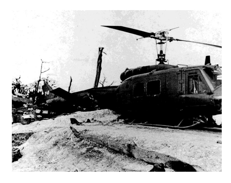
Air America UH-1D Y-11 at helipad "EH" on 13 May 71

Reportedly, 12-14 UH-1Ds were delivered to Air America by the US Army about April 71 (UTD/Leary/B1 for April 71). In fact, 6 US Army UH-1Ds were bailed to Air America and based at Udorn; this bailment was terminated on 30 June 71 (F.O.Circular of 1 July 71, p. 7, in: UTD/Hickler/B8F7B).